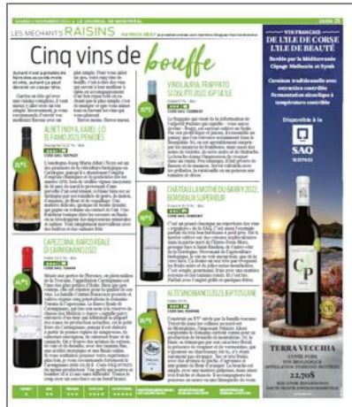
Ex : Global International Networks Wines & Spirits