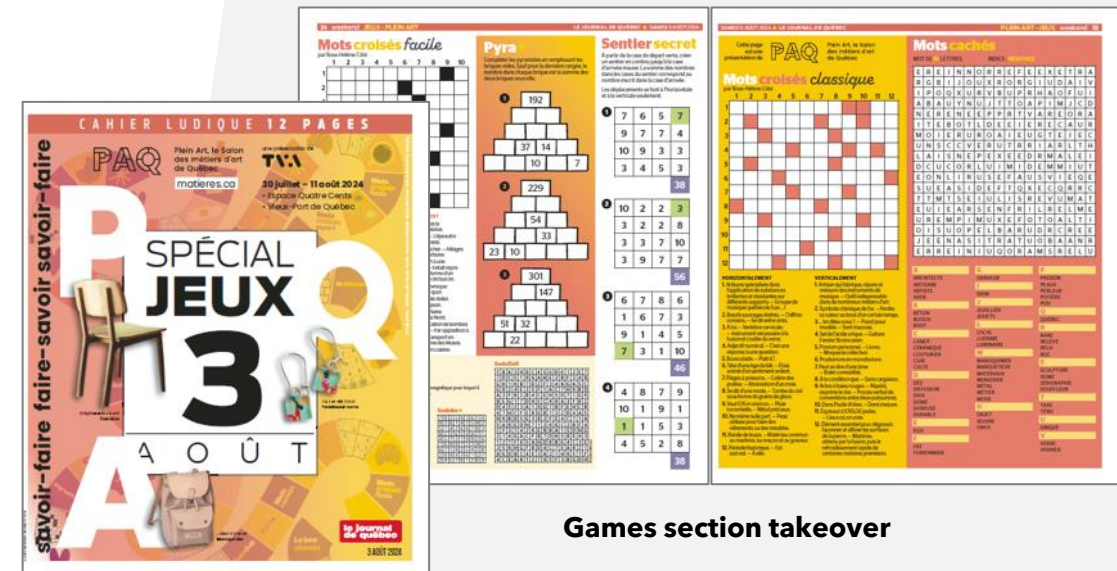
Games section takeover