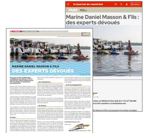
Ex : Marine Daniel Masson & Fils

Content created by a freelance journalist based on the advertiser's brief . The client has 2 rounds of approval . The content must be of interest to readers and be compatible with Le Journal de Montréal .