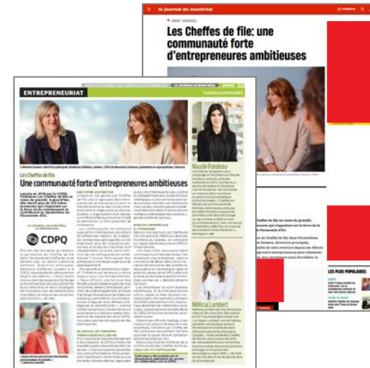
Ex : CDPQ

Your product/service photo and description appear in the article page . Text next to photo. Available only in the decoration-renovation content (Casa supplement) and in the recipes (Zeste supplement).