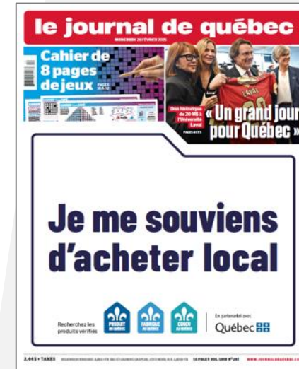
False front page

Your flyers or magazines inserted in Le Journal de Québec , Saturday issue (Weekend supplement).