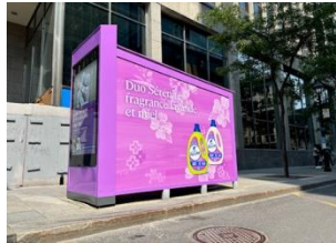
EX.LAVO LA PARISIENNE

Diffusion of a fragrance reminiscent of the smell of laundry!